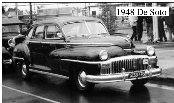
1948 De Soto