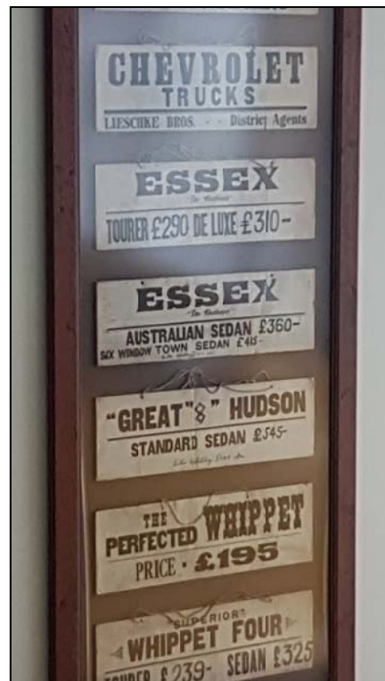
Lieschke Holden dealership Walla Walla

The tours took us to places like Bonegilla Migrant Centre (very informative) Hume Dam, Holbrook, Yackandandah, Beechworth, Stanley