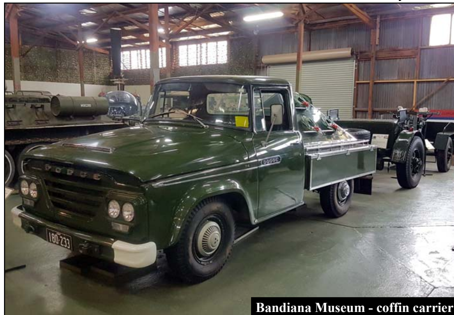
Bandiana Museum - coffin carrier