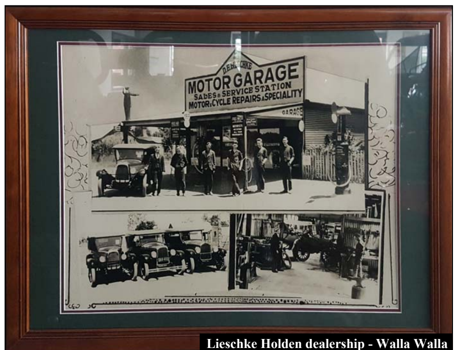
Lieschke Holden dealership - Walla Walla