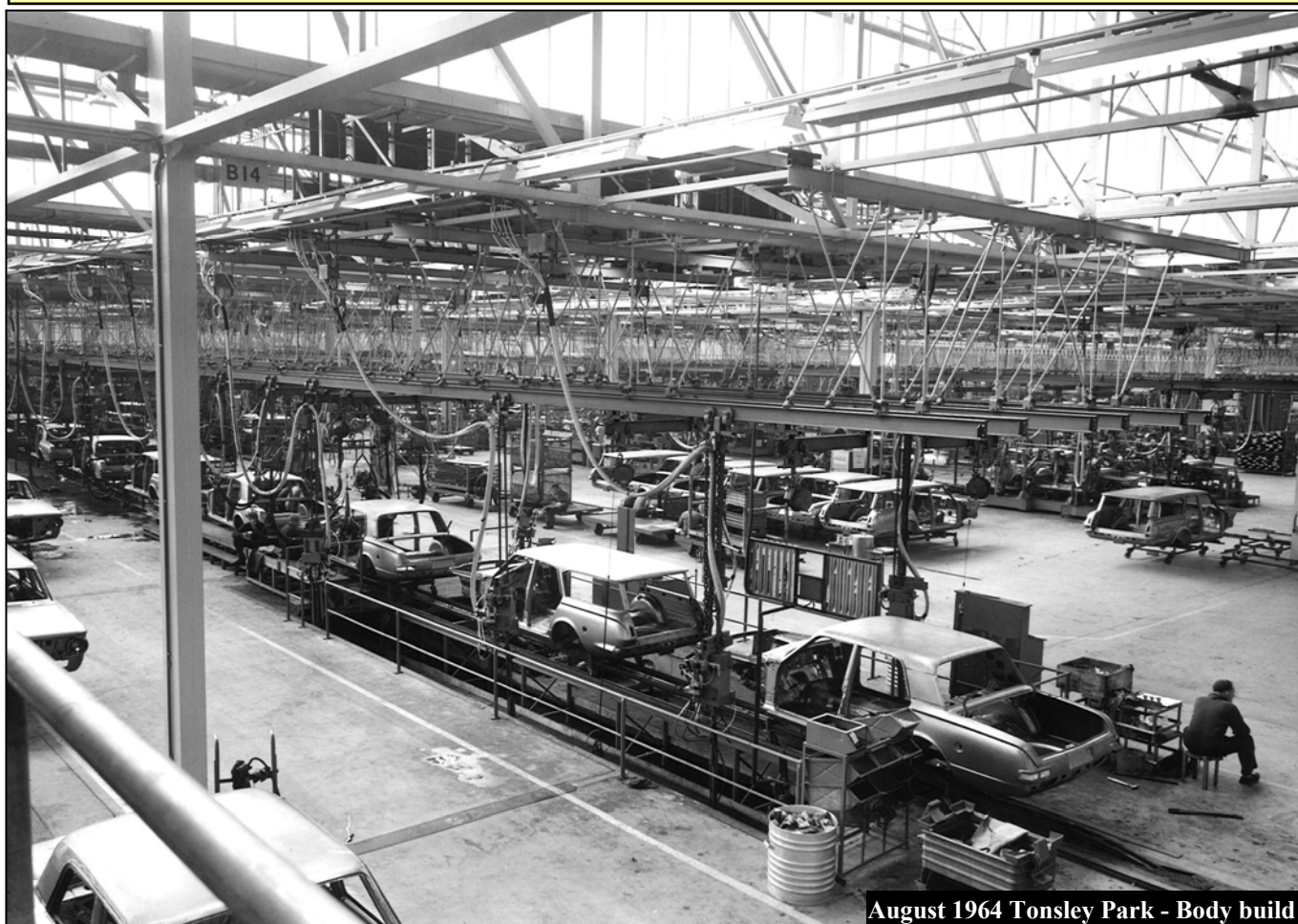
August 1964 Tonsley Park - Body build