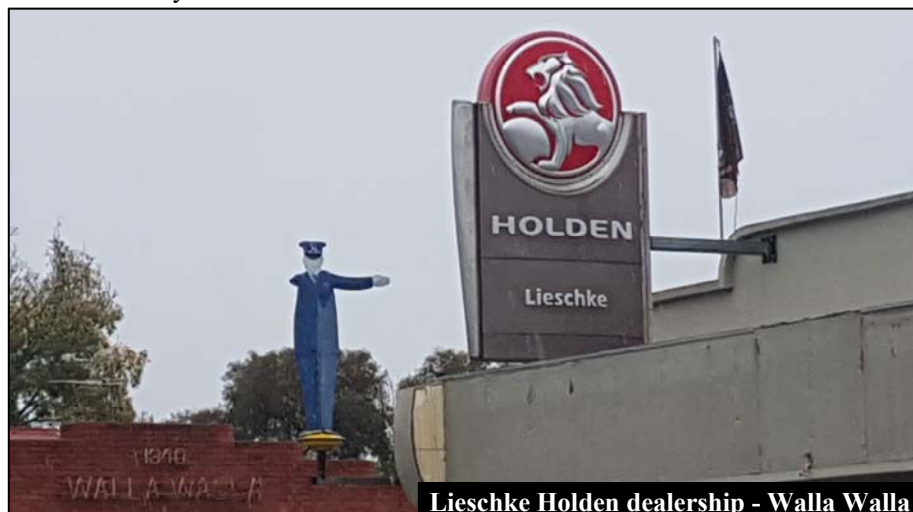
Lieschke Holden dealership - Walla Walla

So after waiting a few minutes we decided that we had missed the others and we rang the RAA (being SA members) our call was transferred to NRMA (NSW) which took about 25 minutes to answer. When they answered they realised we were in Victoria so were transferred to RACV then they had to check with the RAA in SA that we were members. So waiting, waiting, eventually they got the ok and said we will have someone come asap as the rain was making them very busy. So next thing we get a phone call from HowLong a town in NSW on the other side of the River