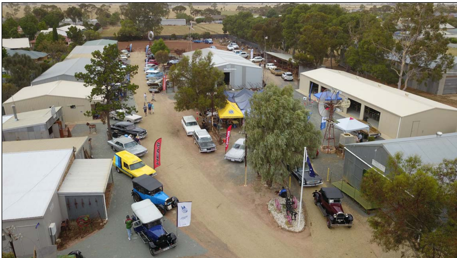
Below