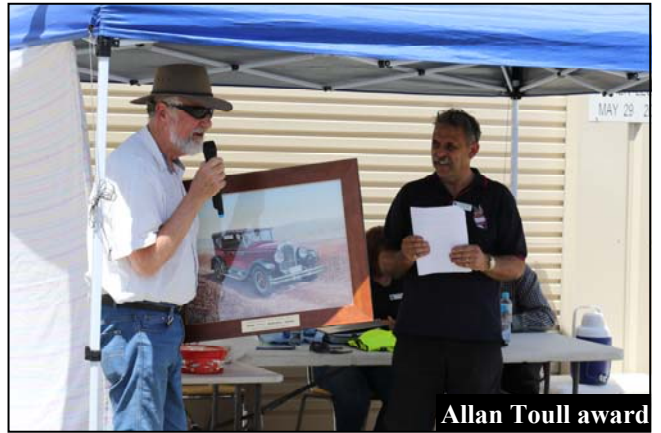
Allan Toull award