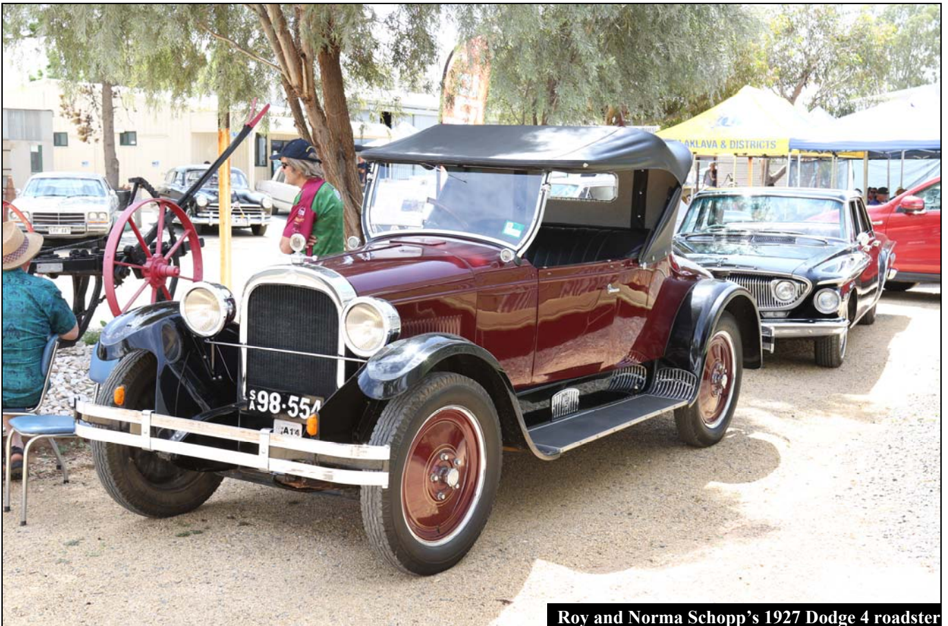
Roy and Norma Schopp's 1927 Dodge 4 roadster