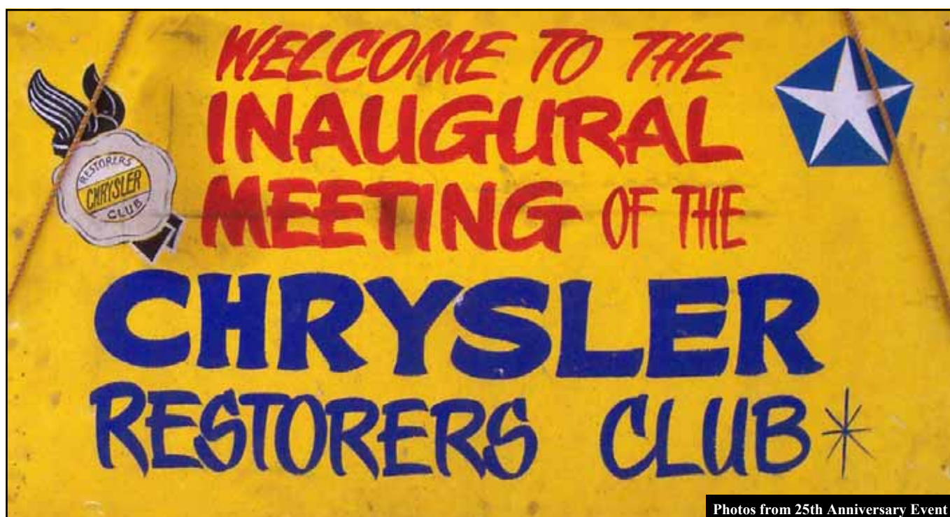
Photos from 25th Anniversary Event

Seven vehicles attended a rally with the Victorian club at