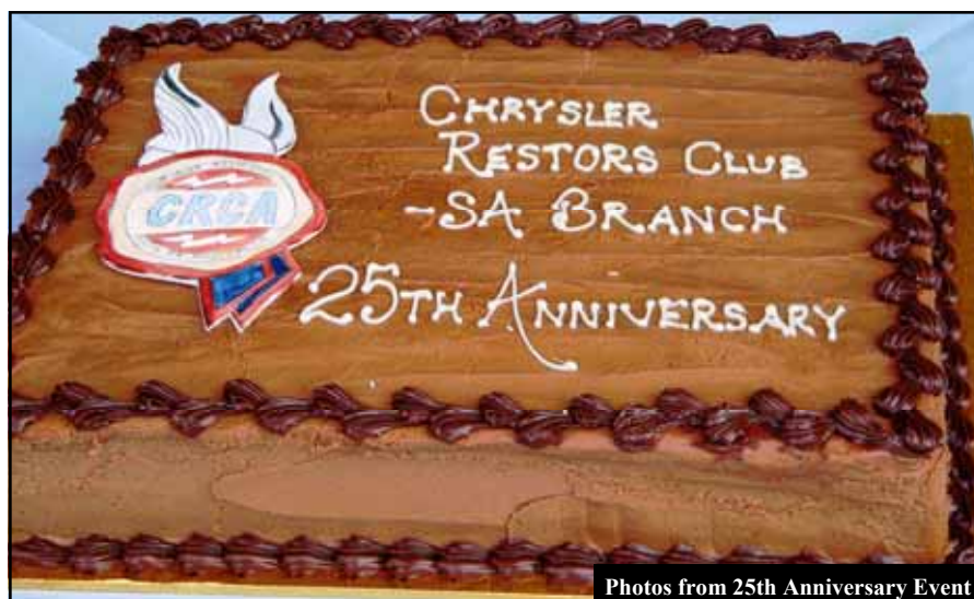
Photos from 25th Anniversary Event