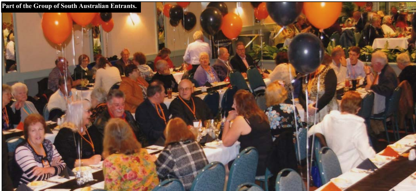
Part of the Group of South Australian Entrants.