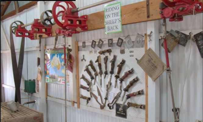
Balaklava Museum Run