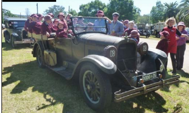
Forbes Dodge Rally