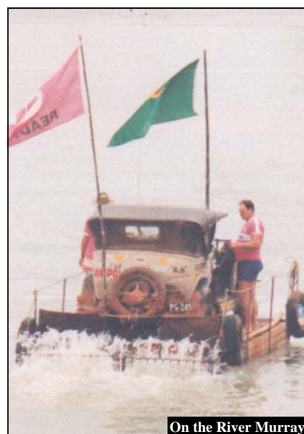
On the River Murray