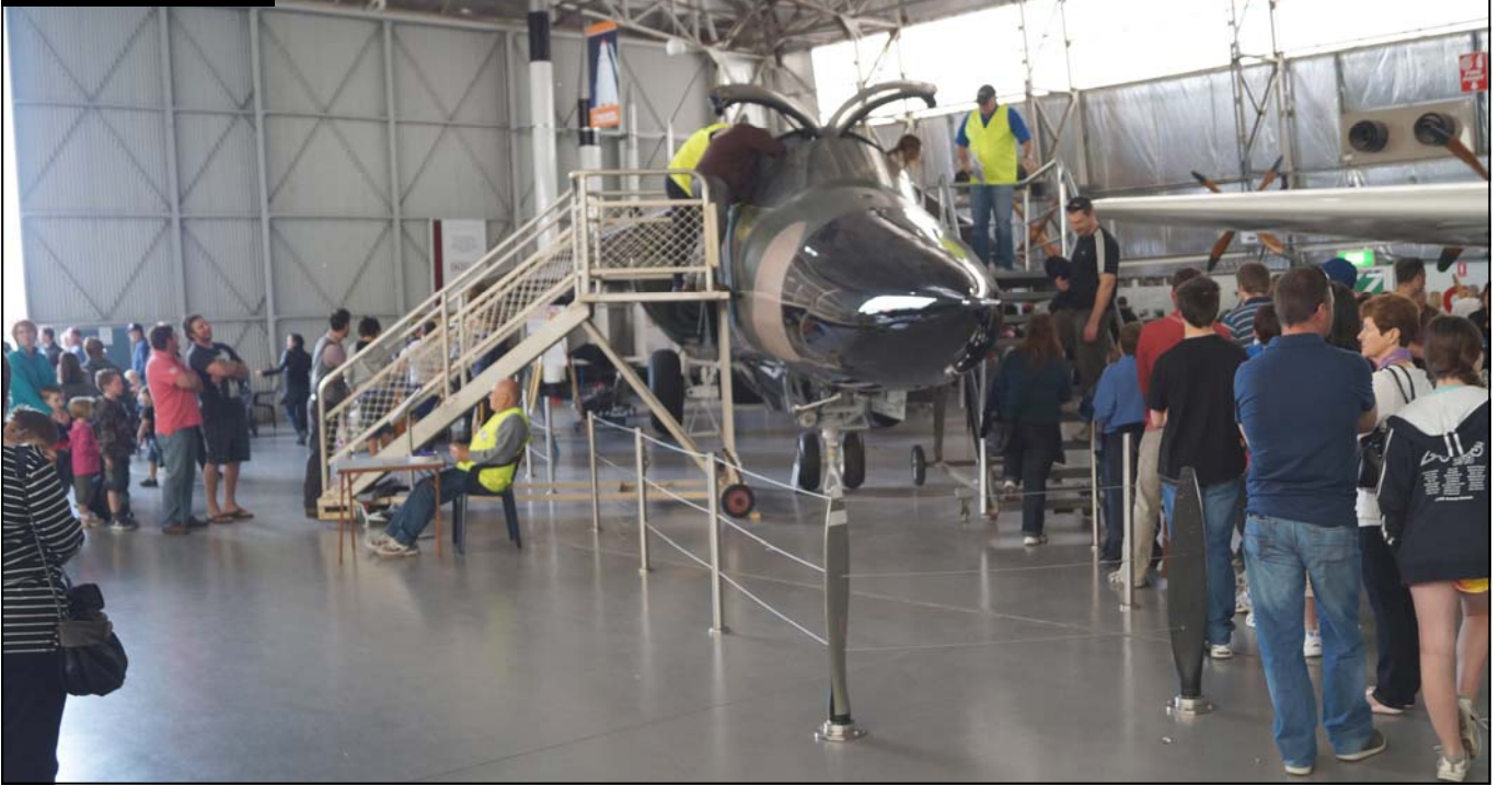
The Popular F111 Display