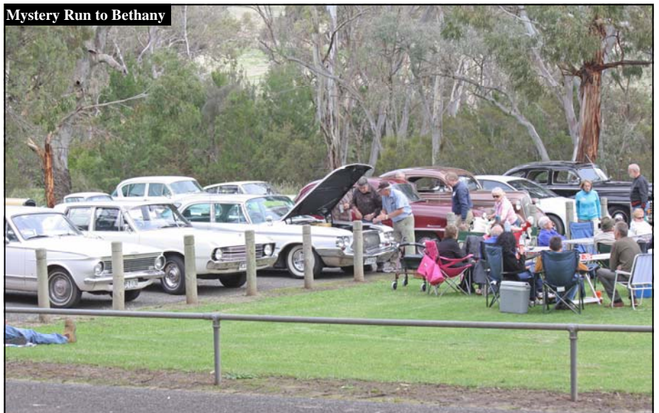
Mystery Run to Bethany