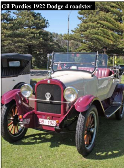
Gil Purdies 1922 Dodge 4 roadster