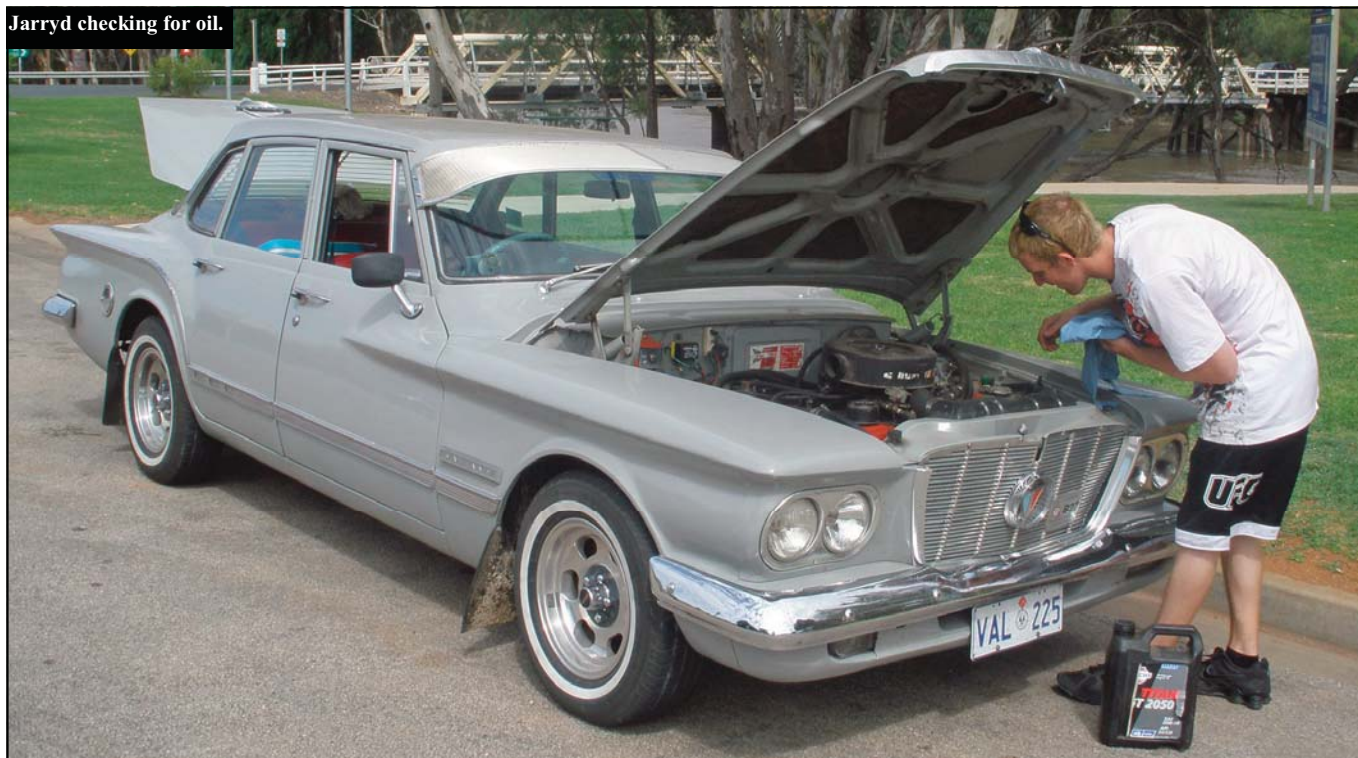
Jarryd checking for oil.