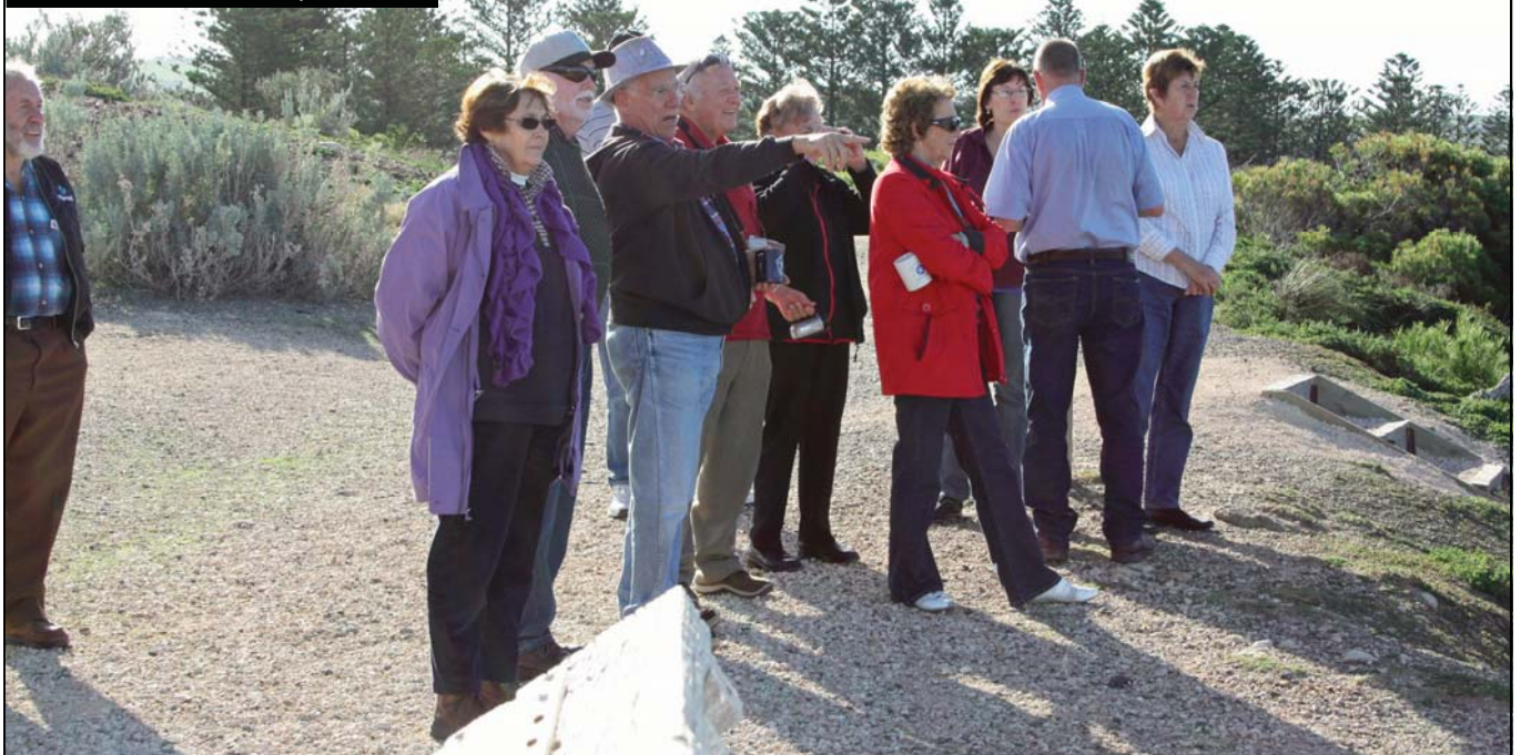
There look there it is, didn't you see it?