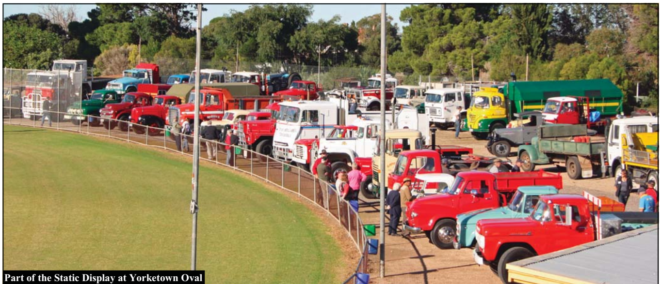
Part of the Static Display at Yorketown Oval

Saturday morning the vehicles assembled ready for the drive to Yorketown for a static display and morning tea at the local football ground. It was quite a