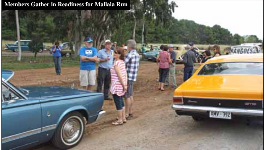
Members Gather in Readiness for Mallala Run