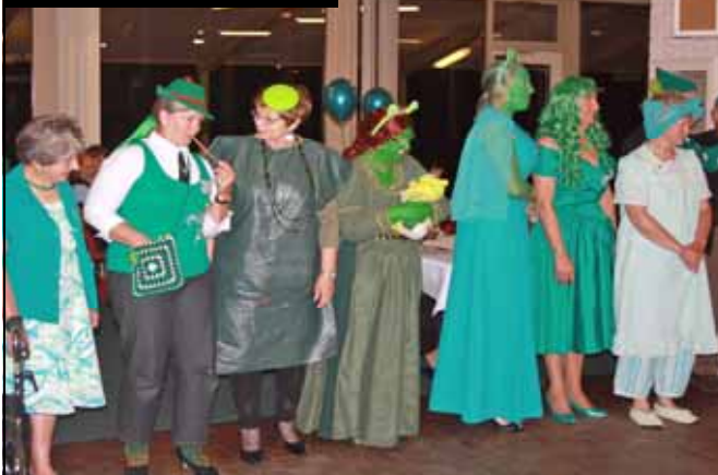
Judging of Ladies Green Theme