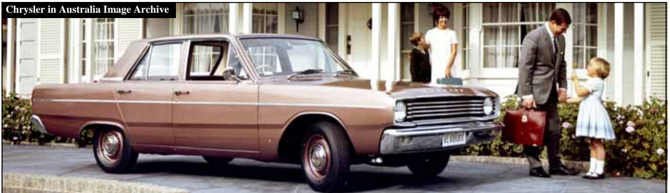
Chrysler in Australia Image Archive