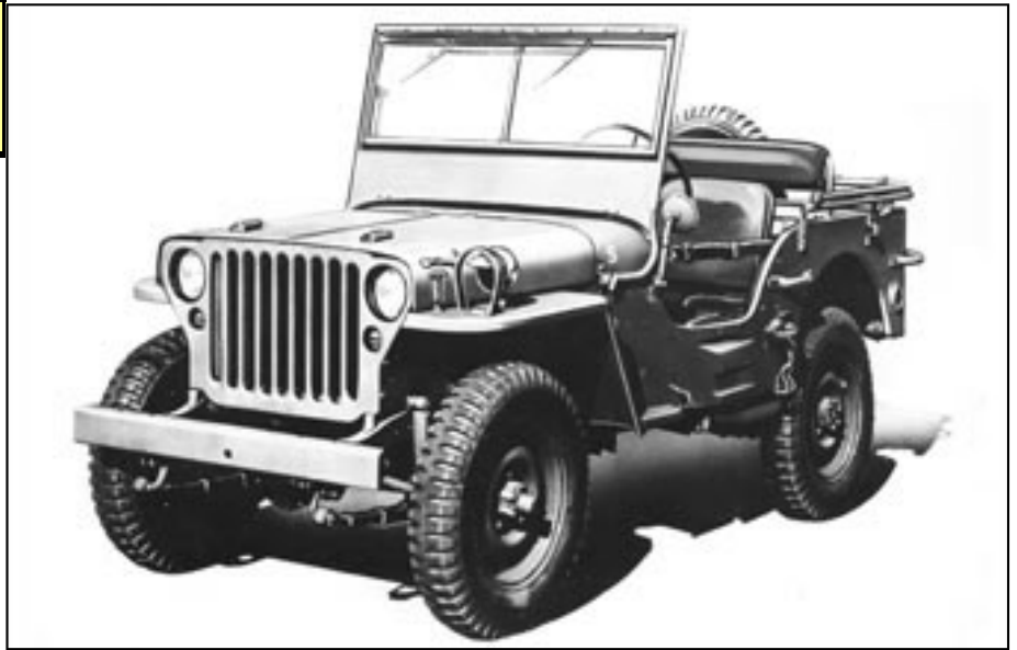
Jeep became part of Chrysler in 1987.

General George C. Marshall called them "America's greatest contribution to modern warfare" and they became the saviour of Willys-Overland, laying the foundation of a global brand.