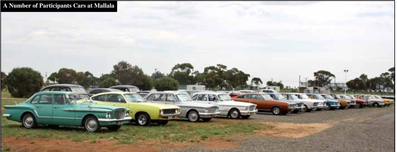
A Number of Participants Cars at Mallala