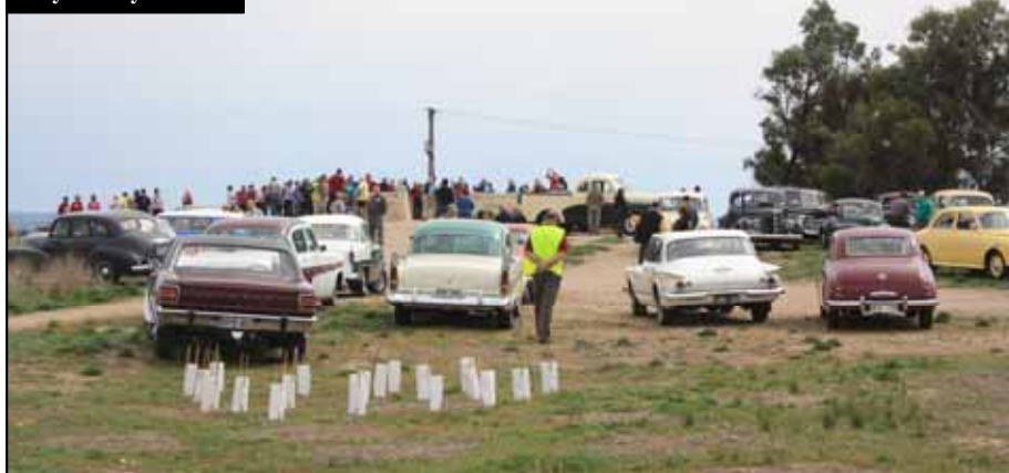
Clayton Bay lookout