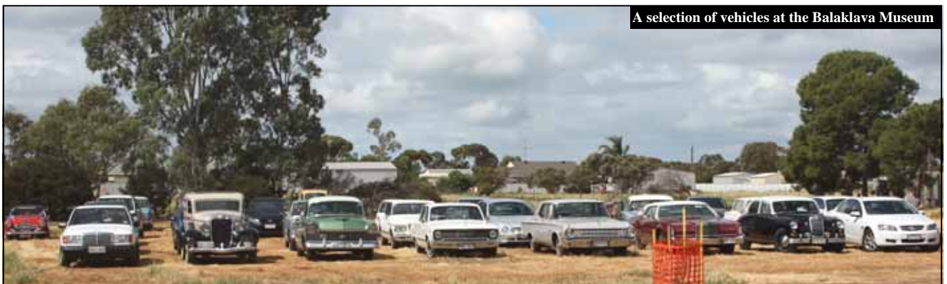
A selection of vehicles at the Balaklava Museum