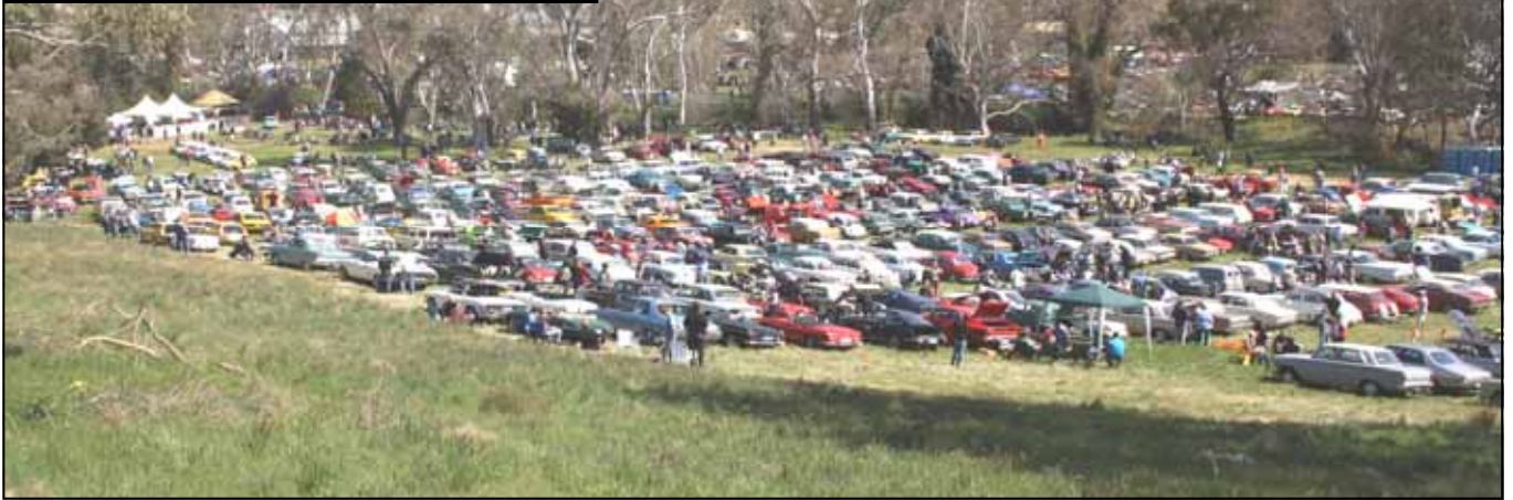
One of the Car Parks of Entrant's Vehicles at Birdwood.

enjoyable being amongst the leading cars, and we were soon being treated to the cheers and waves from the large gathering of spectators. People found vantage points with their picnic and barbecue areas, looking as if they were settled in for the day.