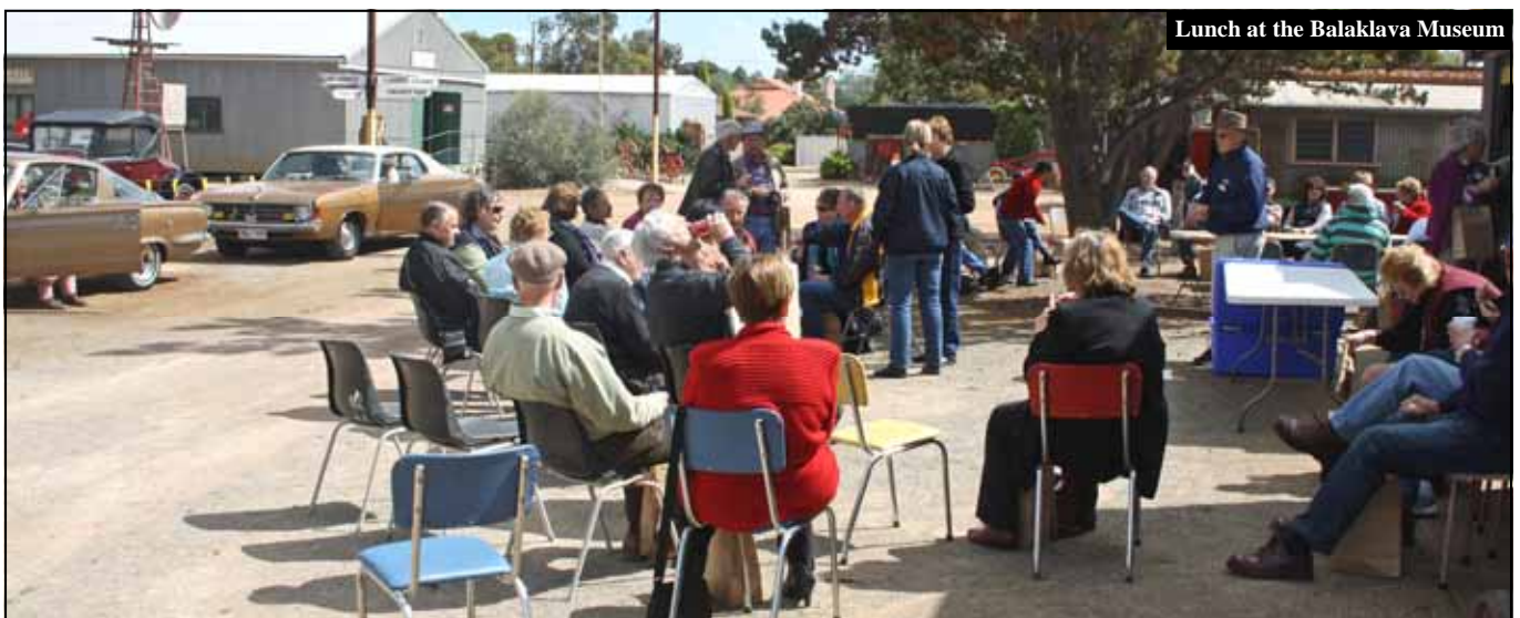
Lunch at the Balaklava Museum