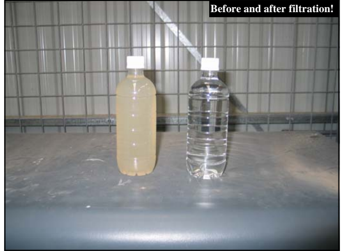
Before and after filtration!