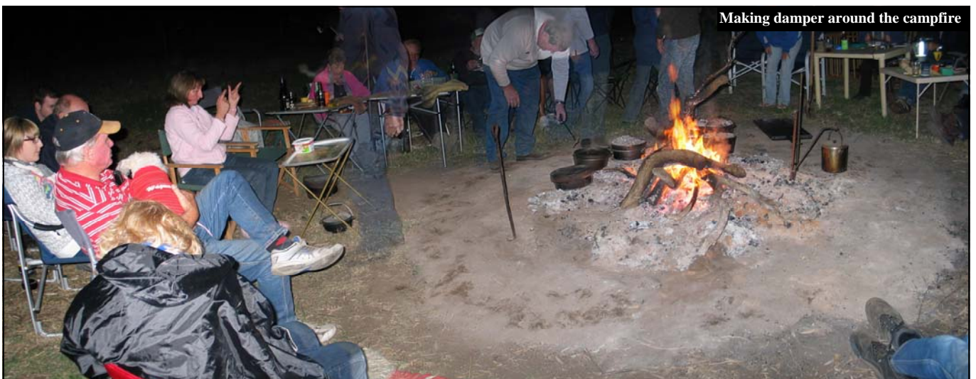
Making damper around the campfire