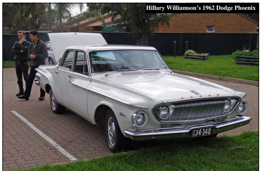
Hillary Williamson's 1962 Dodge Phoenix