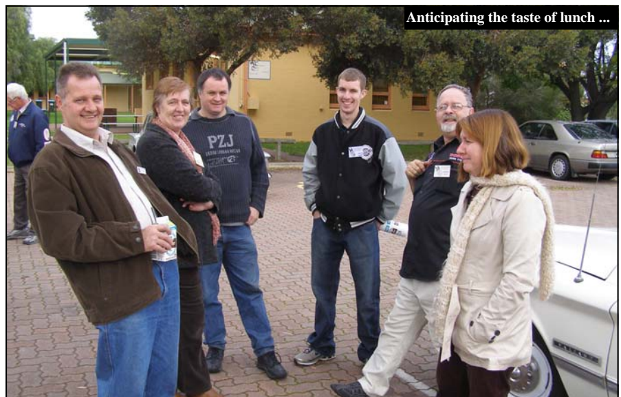
Anticipating the taste of lunch ...