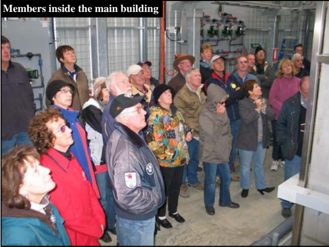
Members inside the main building