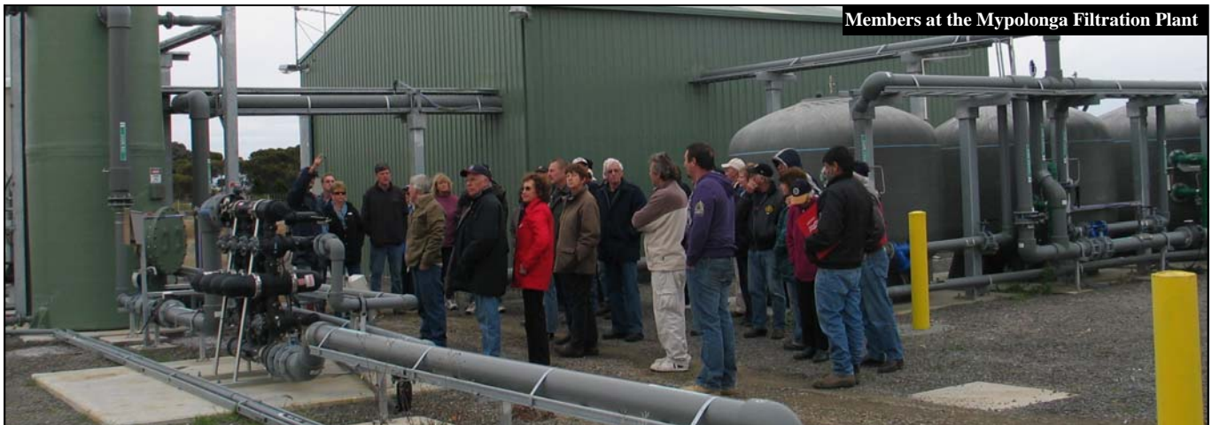
Members at the Mypolonga Filtration Plant