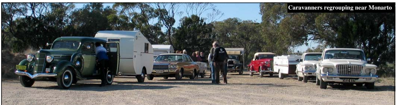
Caravanners regrouping near Monarto