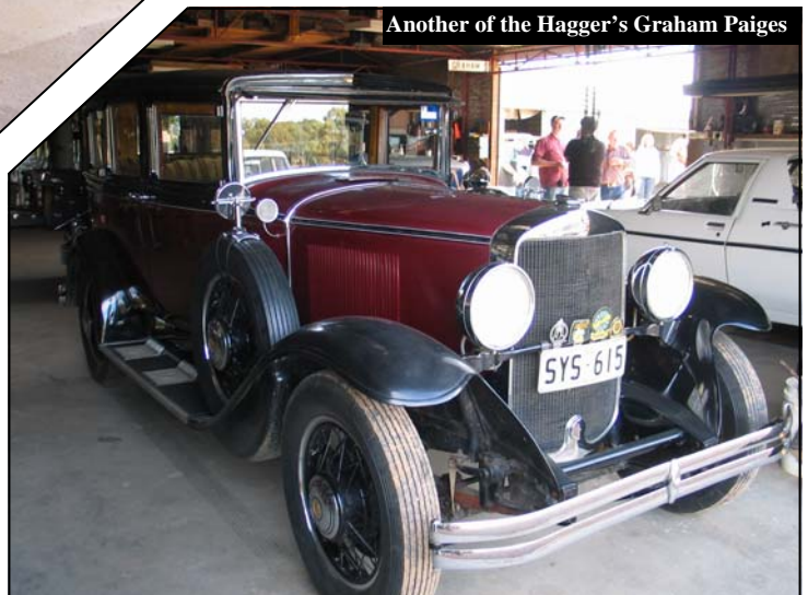
Another of the Hagger's Graham Paiges