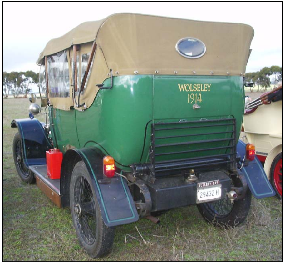
Australia Inc. and the friendship of Members of the Veteran Car Club of Australia (Victoria)

Thanks to members of the Veteran Car Section of the Sporting Car Club of South