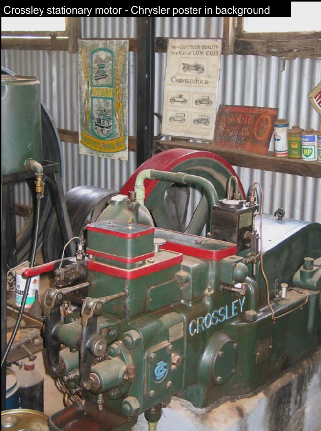
Crossley stationary motor - Chrysler poster in background