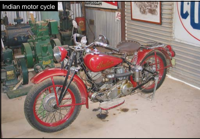
Indian motor cycle