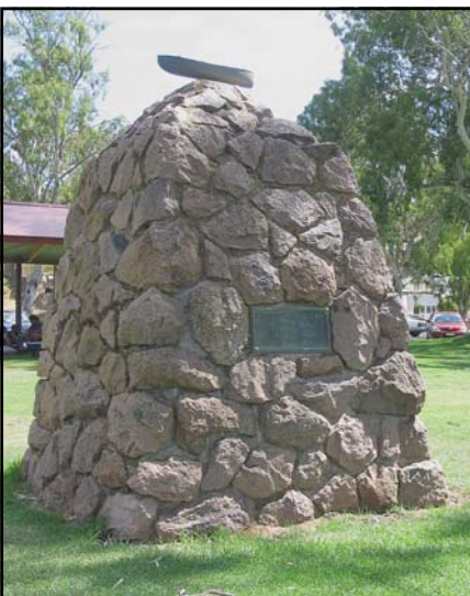
Capt Charles Sturt passed this spot in 1830