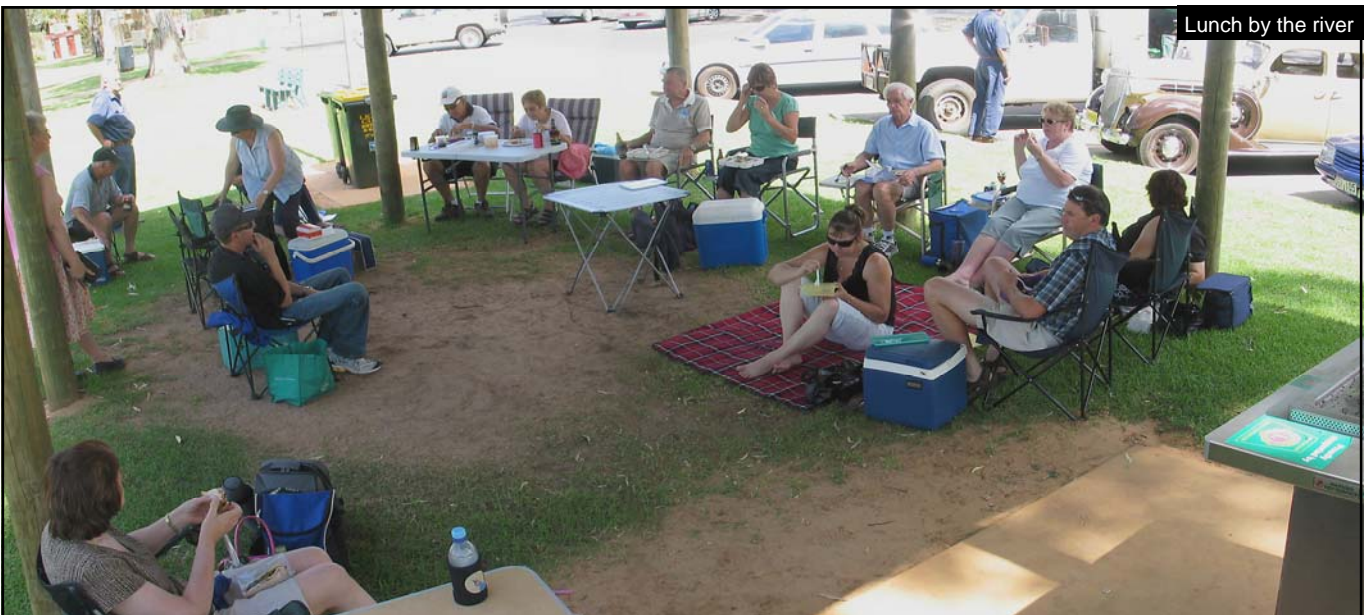
Lunch by the river