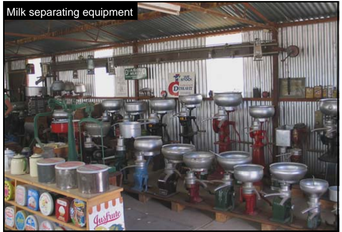
Milk separating equipment