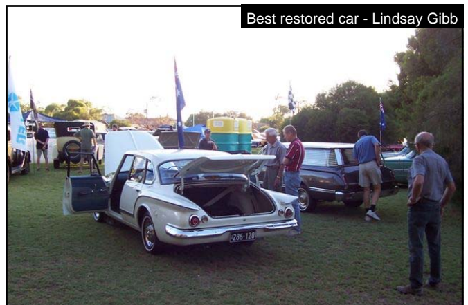
Best restored car - Lindsay Gibb