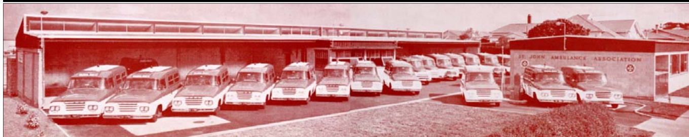
Part of the fleet of 30 Dodge ambulances used by St. Johns in Auckland, New Zealand, in the mid '60s.